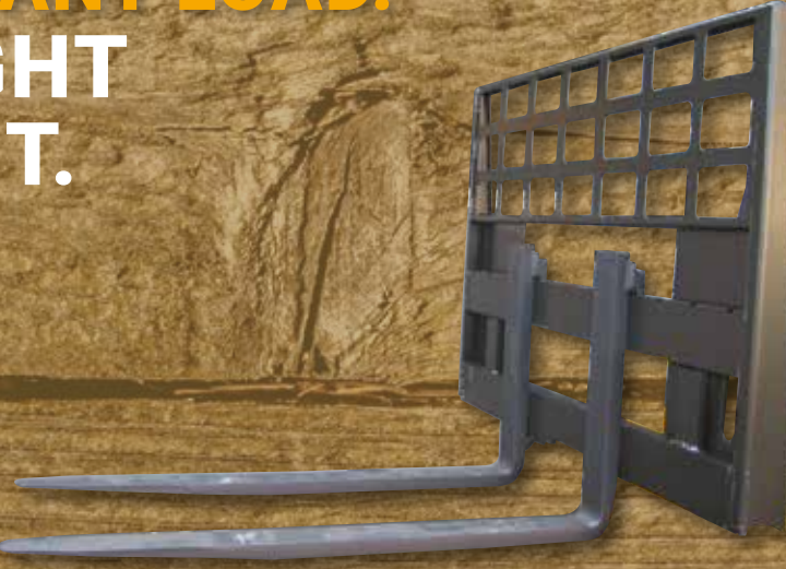
fork carrier plates

SIMA lifting forks can be applied to any type of skid, backhoe loader or wheeled loader, telescopic forklift (the versions applied to the skids are equipped with rollover protection of the load.)